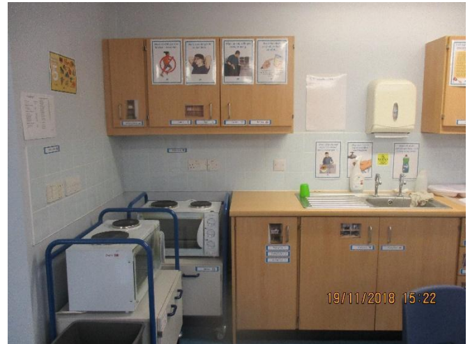
Purpose of study

Design and technology is an inspiring, rigorous and practical subject. Using creativity and imagination, pupils design and make products that solve real and relevant problems within a variety of contexts, considering their own and others' needs, wants and values. They acquire a broad range of subject knowledge and draw on disciplines such as mathematics, science, engineering, computing and art. Pupils learn how to take risks, becoming resourceful, innovative, enterprising and capable citizens. Through the evaluation of past and present design and technology, they develop a critical understanding of its impact on daily life and the wider world. High-quality design and technology education makes an essential contribution to the creativity, culture, wealth and well-being of the nation.