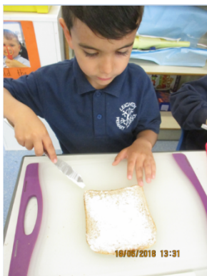
Making sandwiches in reception.