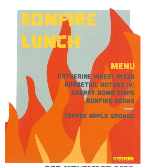
3RD NOVEMBER 2023

Due to meatballs being served for Halloween, Monday 30th October, the lunch menu choice will be Pepperoni or Cheese Pizza instead.